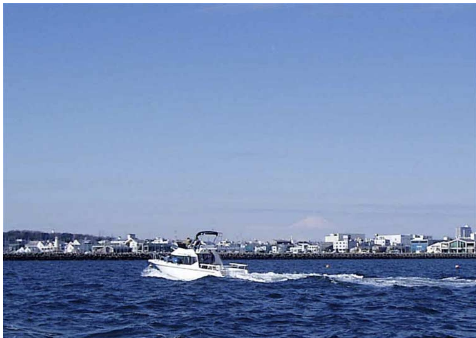
Figure 3. Mount Fuji seen from a boat some 3 km off Bayside Marina in Negishi Bay, Yokohama, close to the probable viewpoint for The great wave off Kanagawa , but in more clement weather. If we imagine the state of the sea as in the Hokusai image, and mentally remove the development on the coast, we can see that waves could easily obscure all land except Mount Fuji, as in Hokusai's image. (Online version in colour.)