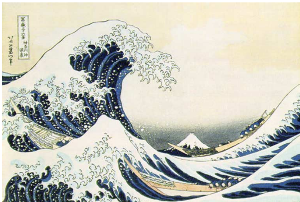
Figure 1. The great wave off Kanagawa . How many impressions Hokusai made is not known; the various editions also show detail differences in colours and in elements of the design, as a result of wear in the woodblocks. As the original woodblock prints are more than 180 years old, the colour also varies from copy to copy according to its state of preservation; in some instances the clouds and spray are barely discernible, and the colour of the sky at the top varies from yellow to pink. (Online version in colour.)

Katsushika Hokusai 6 was born in 1760 in Edo—present-day Tokyo—where, except for short periods, he lived his whole life. He dedicated himself to art, portraying scenes ranging from nature to cityscapes, in watercolours as well as in woodblock prints. He is today almost undoubtedly the most world-renowned Japanese artist, 7 although within Japan itself he is not generally accorded such eminence, in part because the ukiyo-e (pictures of the floating world) art movement of which he was a member was popular rather than high-status art, and also because he chose to portray less typically Japanese subjects in his work; possibly it is the very non-Japaneseness of his art that gives him his worldwide appeal. Hokusai was an apprentice of ukiyo-e artist Katsukawa Shunsho, but his work also incorporates influences from the traditional Japanese Kano school and from Chinese and Dutch landscape painting. 8 During his lifetime Japan was practically a closed country with the only contact with the West being through Dutch traders permitted to live far from Tokyo on an artificial island, Dejima, in Nagasaki harbour; the country was reopened in the decade after his death and his works began to gain wide recognition by Westerners.