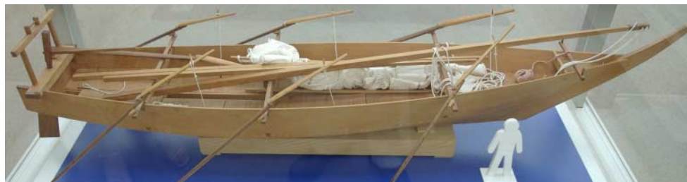
Figure 2. Model oshiokuri in Yokohama maritime museum. As well as having oars, oshiokuri carried a dismantable mast with sails to put up in a suitable wind; they may be classed as a type of skiff. The single-oar sculling technique employed with oshiokuri was once widespread in many parts of the world, 55 but today may be encountered perhaps most notably with a Venetian gondola; in fact, the Venetians had multiple crewed sculled boats similar to oshiokuri for transporting cargo. This model oshiokuri has six oars, compared with the two or four reported by Bird and the eight of the boats meeting the great wave. The outriggers on this model are much farther apart than on the boats Hokusai drew; he depicts five closely spaced outriggers—with only four in use—on the most distant boat in The great wave . Could oshiokuri have been sculled with the outriggers as closely spaced as Hokusai shows? It is not clear. (Online version in colour.)