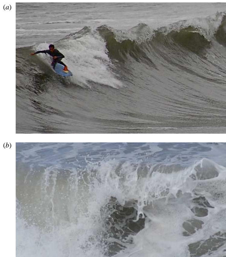
Figure 7. Breaking waves. (a) A breaking wave captured at an instant not dissimilar to that seen in The great wave off Kanagawa . In the foreground it is not yet breaking; near to the surfer it is a spilling breaker; and in the background it is a plunging breaker like that in The great wave . This is a wind-produced wave much smaller than the wave depicted in The great wave , but we can see that Hokusai, working before photography, captured very well the shape of a breaking wave and had noted the way in which the wave breaks up into fingers that pinch off into drops at their tips. (b) A close-up view of a plunging breaker shows that the fingering can even produce claw-like forms similar to those in The great wave . (Online version in colour.)

covering of snow. Today this snow cover is seen on Fuji before May and after October, and we can tell that the situation in about 1830 was not dissimilar, as the range of snow cover on the peak depicted by Hokusai throughout the ‘Thirty-six views’ series is similar to what is seen throughout the year today. The snow rules out the scene’s being associated with the tropical cyclones called typhoons. In the Tokyo region, the typhoon season is generally from the end of July to the beginning of October, during which months there is little or no snow on Fuji. If set in spring or autumn, the scene would correspond most closely to the passage of a so-called bomb cyclone, an extratropical maritime, cold-season cyclone that can develop extremely rapidly into an intense storm that can sink shipping. 39 In Japan these cyclones are associated with the Kuroshio, the warm current that flows east south of the Japanese islands, and with so-called El Niño years in which that series of climatic changes is operating. 40 A study of wave heights in and around Tokyo Bay discloses that extreme waves tend to come from the south, as here, and that the largest waves appear from March to May (when bomb cyclones may occur) and in August or September (during typhoons). 41 The publication Guide