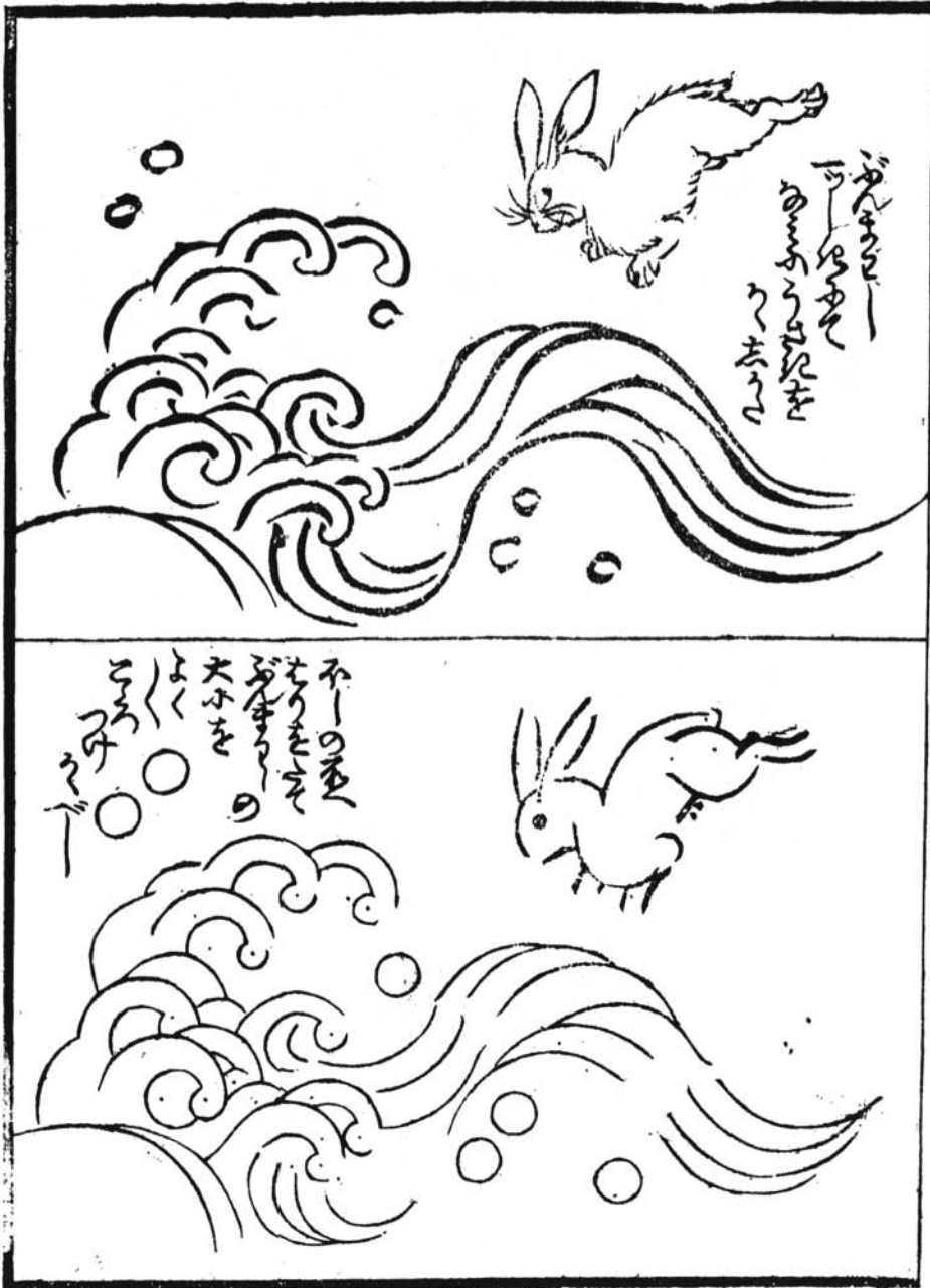
Figure 6. Hokusai's Ryakuga Haya-oshie of 1812 shows that he had an intuitive grasp of the presence of self similarity in nature that leads to what today are known as fractals. In the page reproduced here he demonstrates that drawing arcs of circles of various radii allows one to replicate the form of breaking waves and of a rabbit. 33

We can glean from the image quite a significant amount of information on the season: the crew of the oshiokuri are wearing samue, so it is spring or autumn; the samue are blue, so it is probably spring although it might be autumn; and Fuji is snow-capped, with an appreciable