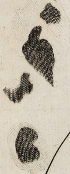
Fig. III. 14 Augusti